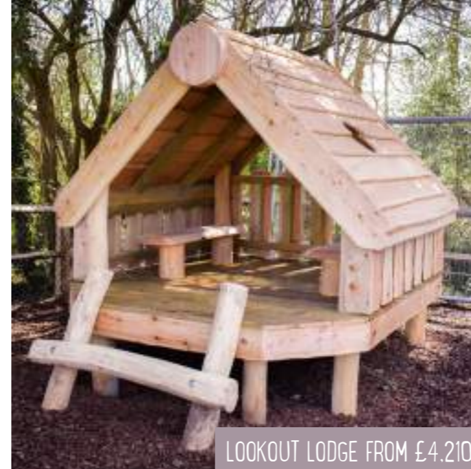
LOOKOUT LODGE FROM £4.210