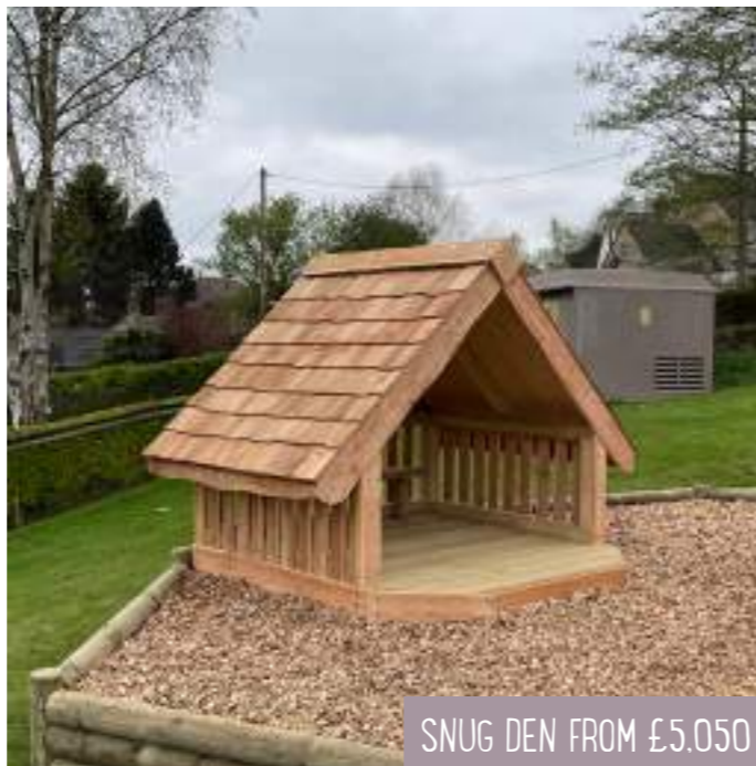
SNUG DEN FROM £5.050