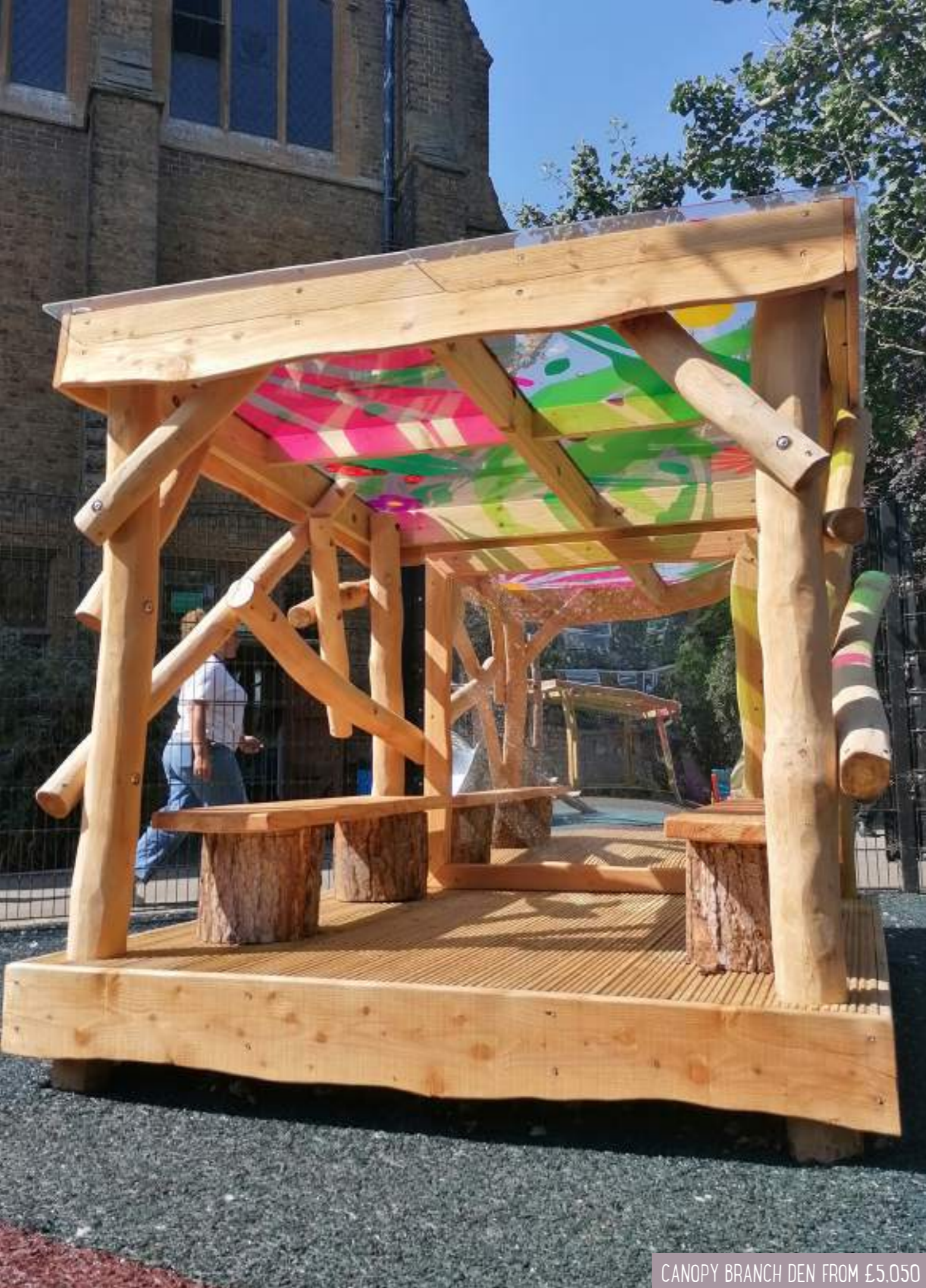
CANOPY BRANCH DEN FROM £5.050