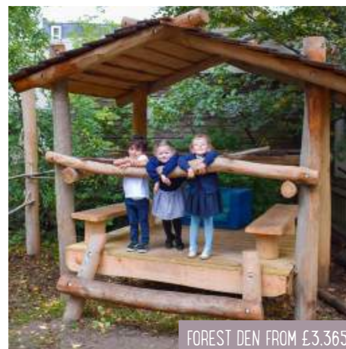
FOREST DEN FROM £3.365