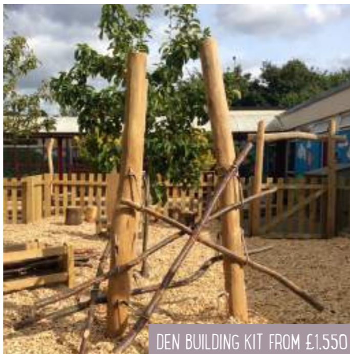
DEN BUILDING KIT FROM £1.550