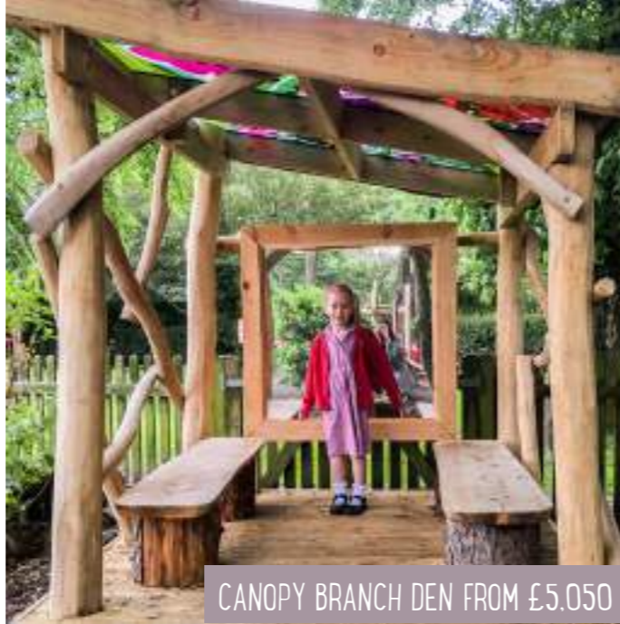
CANOPY BRANCH DEN FROM £5.050

A child will enjoy creating their own games, rules and scenarios as they revise and refine their den, all the time developing their creativity as new stories are produced.