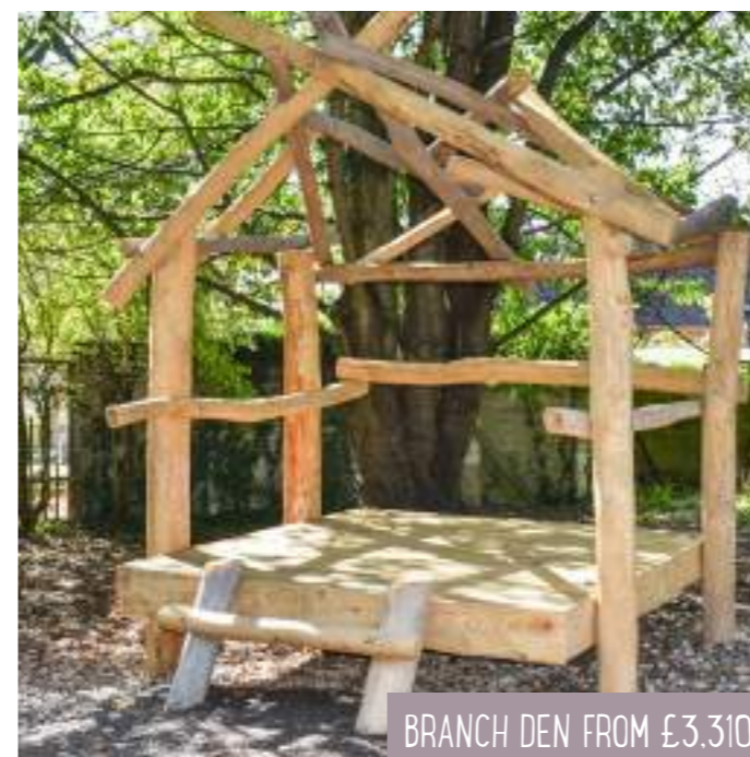
BRANCH DEN FROM £3.310